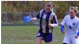
The St. Joseph Central girls soccer team visited Drury on...