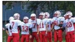
Hoosac Valley Ran the Ball Right at Amherst, for 242 to 43...