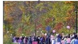
The 2nd Annual Making Strides Against Breast Cancer...