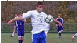
St. Joseph Central soccer team beat Drury, 4 to 2, on Oct...