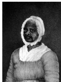
Elizabeth Freeman, painted by Susan Ridley Sedgwick, circa 1812.

The Ashley House is a property of The Trustees of Reservations and an anchor site on the African American Heritage Trail. It is located at 117 Cooper Hill Road. For more information about the open house and ceremony, visit www.TheTrustees.org or call 413-298-3239. For more information about The African American Heritage Trail, visit